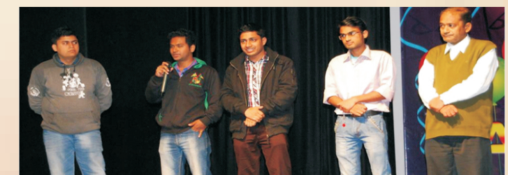
The Assembly of Recent Toppers