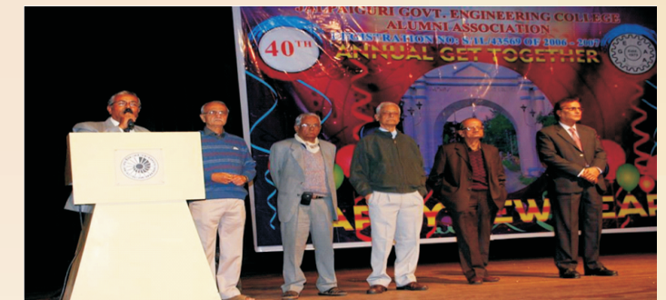
Inauguration of the Annual Programme